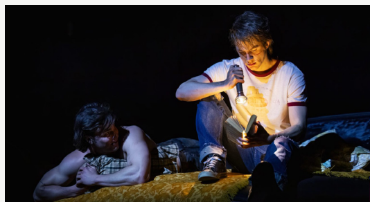
The Outsiders - Great Expectations 01 - Photo by Matthew Murphy