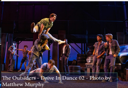
The Outsiders - Drive In Dance 02