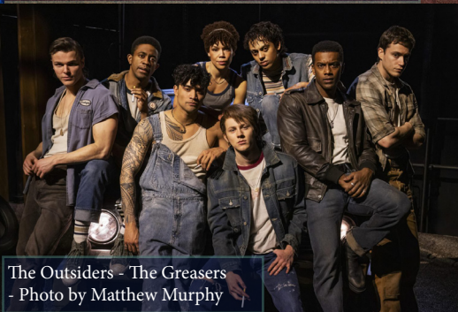
The Outsiders - The Greasers