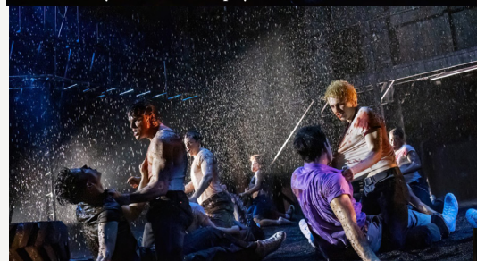
The Outsiders - The Rumble 02