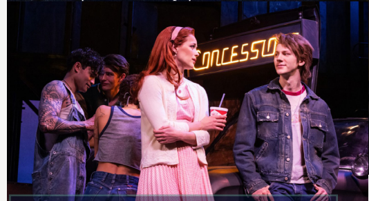
The Outsiders - Cherry & Ponyboy