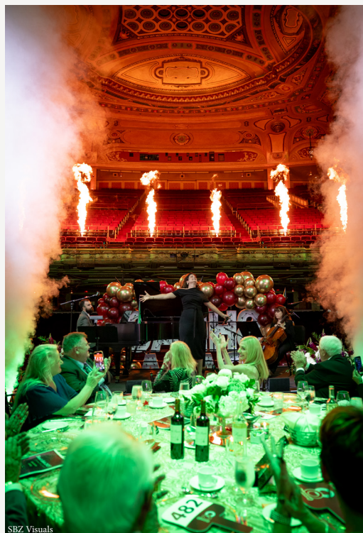
Tony Award Winner Stephanie J. Block wows Gala Guests with her performance of WICKED 's "Defying Gravity."

She is also well known for her portrayal of Elphaba in the Broadway company of WICKED . Block performed an arrangement of "Somewhere Over the Rainbow" and then brought the house down with her rendition of "Defying Gravity."