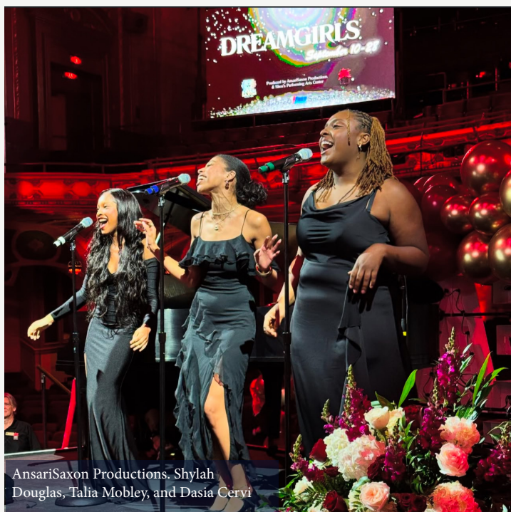
The Dreams give a stunning sneak peak performance of DREAMGIRLS .

The performances did not stop there! Guests were then treated to a sneak preview performance of DREAMGIRLS . The musical, co-produced by Shea's and AnsariSaxon Productions, will be featured as part of the 2025-26 Frey Electric Season at Shea's 710 Theatre from September 10 – 28, 2025. Tickets are onsale now!