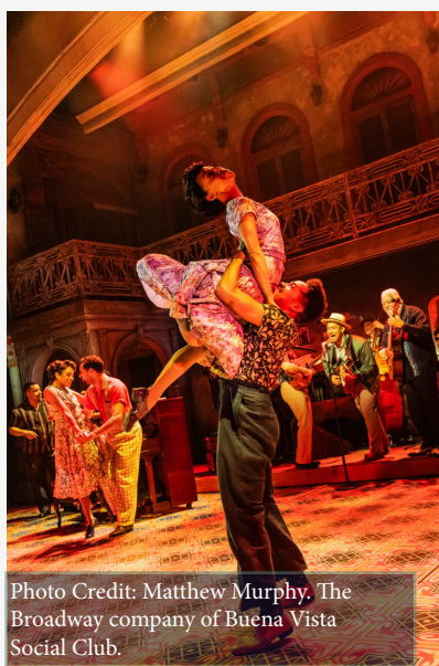
The Broadway company of Buena Vista Social Club.