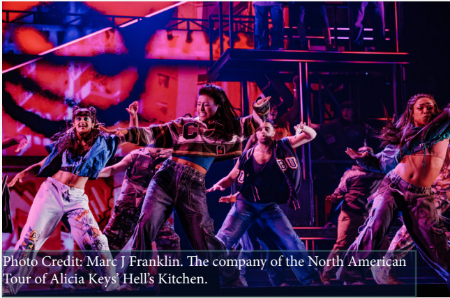
The company of the North American Tour of Alicia Keys' Hell's Kitchen.

hits and new songs written exclusively for the show—is brought to life through exhilarating choreography. It's a soundtrack of rebellion, life, and love that speaks