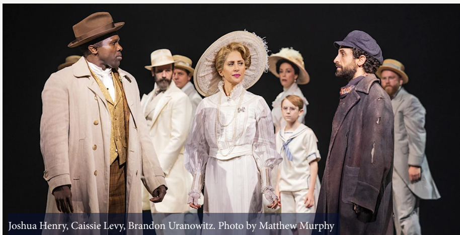
Joshua Henry, Caissie Levy, Brandon Uranowitz.

Based on E. L. Doctorow's celebrated novel, RAGTIME weaves together the stories of three families chasing the American Dream at the dawn of the 20th century. The musical follows Black pianist Coalhouse Walker, Jr. and Sarah, Jewish immigrant Tateh and his young daughter, and a wealthy white family led by Mother — all connected through hope, ambition, and a rapidly changing America.