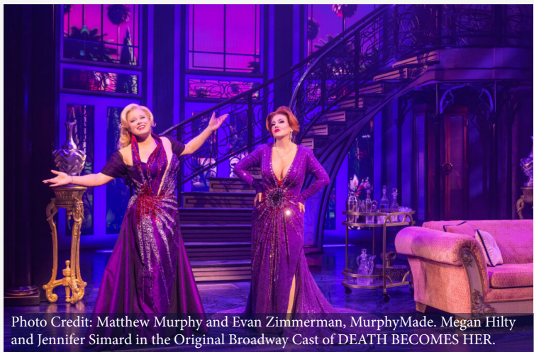
Megan Hilty and Jennifer Simard in the Original Broadway Cast of DEATH BECOMES HER.

Madeline Ashton is the most beautiful actress (just ask her) ever to grace the stage and screen. Helen Sharp is the long-suffering author (just ask her) who lives in her shadow. They have always been the best of frenemies...until Madeline steals Helen's fiancé away. As Helen plots revenge and Madeline clings to her rapidly fading star, their world is suddenly turned upside down by Viola Van Horn, a mysterious woman with a secret that's to die for.