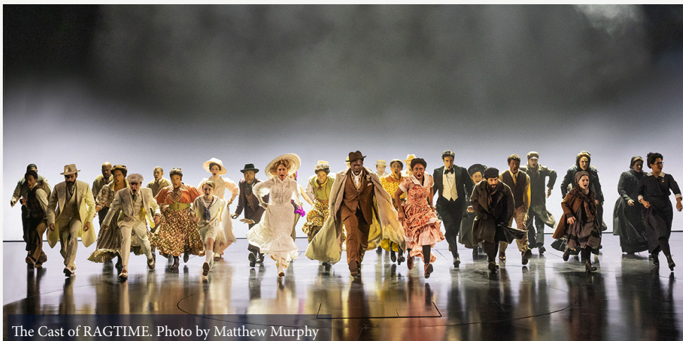
The Cast of RAGTIME.

Fresh off its triumph at the 2026 Tony Awards®, RAGTIME is already setting its sights on Buffalo. Just one day after earning Broadway’s highest honor for Best Musical Revival, Shea’s Performing Arts Center announced that the acclaimed production will launch its brand-new North American Tour at Shea’s Buffalo Theatre in fall 2027.