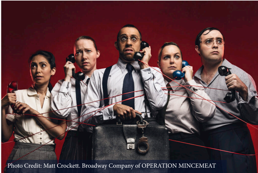
Broadway Company of OPERATION MINCEMEAT

It’s 1943 and the Allies are on the ropes. Luckily, they’re about to gamble our futures on a stolen corpse. Singin’ in the Rain meets Strangers on a Train, it’s the fast-paced, hilarious true story of the secret mission that won WWII.